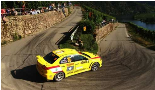
Figure 1: An example of a hairpin turn.

The method has been implemented in the JModelica.org open-source Modelica platform. The implementation is evaluated on two industrially relevant benchmark problems. The first problem is a minimum-time problem, where we seek the time-optimal maneuver for an automobile in a hairpin turn, see Figure 1. The second problem is to optimize the warm startup of a combined-cycle power plant, whose model diagram is displayed in Figure 2.