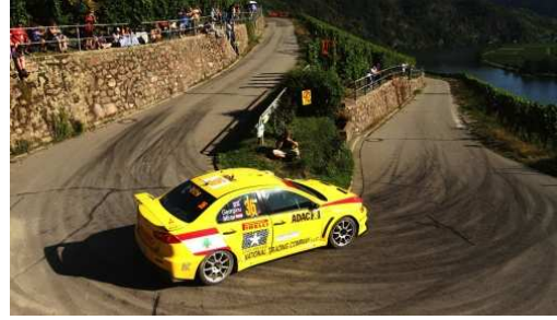
Figure 1: An example of a hairpin turn.

are lumped together. The model has three degrees of freedom: two translational and one rotational.