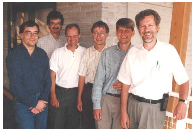
The picture below shows participants of the 75 th Modelica design meeting in Lund May 2012.